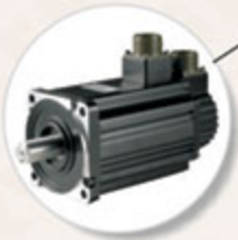
AC Servo motor