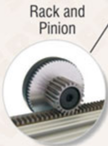
Rack and Pinion