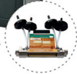
SPECTRA Polaris Print Head 35pl