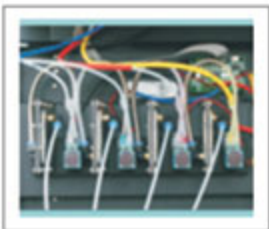
Ink Supply System