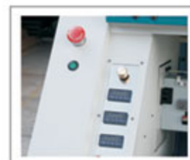
PID Temp. Control