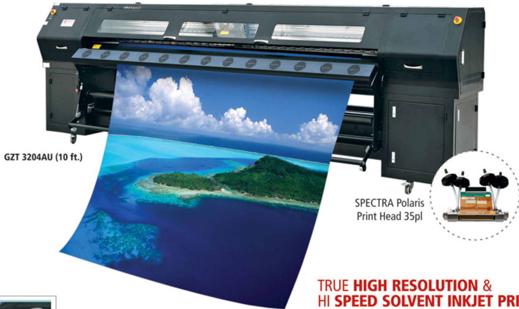
GZT 3204AU (10 ft.)