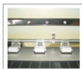
Silent Linear Guide