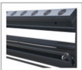
Drying Fan System