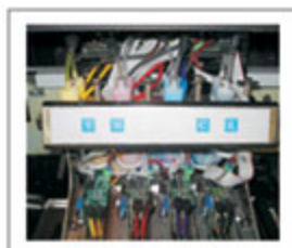
One Button Purge System