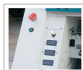
PID Temp. Control