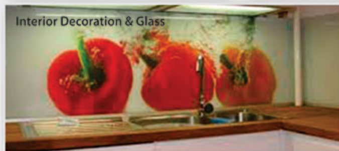
Interior Decoration & Glass